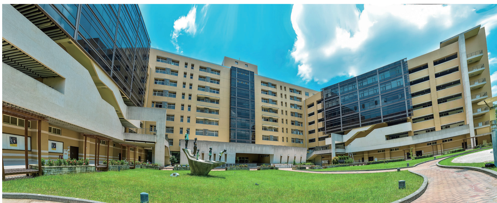
The building of College of Law and Politics in NCHU.

Taiwan is currently the 22nd largest economy in the world and ranks 15th in the world in GDP per capita. It is an island nation centrally located in the Asia Pacific and boasts one of the most progressive and multicultural societies in the region. Taichung has 2.8 million dwellers and is the second largest metropolis in Taiwan, behind Taipei, the capital city. As a vibrant and relaxed city, Taichung consistently ranks among the top cities for living in Taiwan.